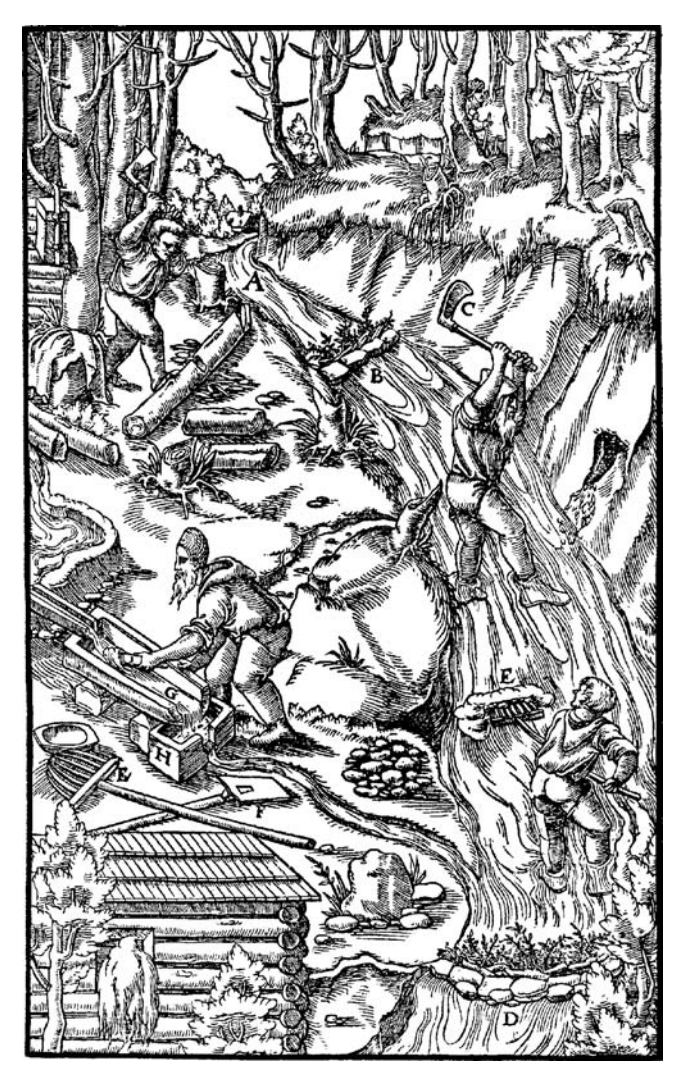
Figure 1. Economic Activity with Enthusiasm: Modernity's New Recognition of the Instrumental Value of Nature (1556 Lithograph, from Agricola 337).

pitched in foreign sea-swells, while land that once was free as sunshine and fresh air surveyors now carefully marked with boundary lines. Not only was the rich earth dug down into her bowels and brought out the wealth she had hidden there, the source of all evils that she had buried deep in Stygian darkness (op. cit. 12).